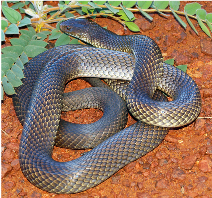
FIGURE 2. The large (160cm) female Common Mulga Snake ( Pseudechis australis ) responsible for the bite that caused decomposition of author's left index finger.