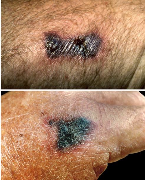
FIGURE 5. Localised necrosis experienced by the author following previous envenomations by Tiger Snake ( Notechis scutatus ) on outside of right wrist at twenty-four hours post bite (top) and Common Mulga Snake ( Pseudechis australis ) on index knuckle of left hand at forty-eight hours post bite (bottom). In both cases, pressure was applied directly over bite site immediately post bite resulting in permanent scarring.