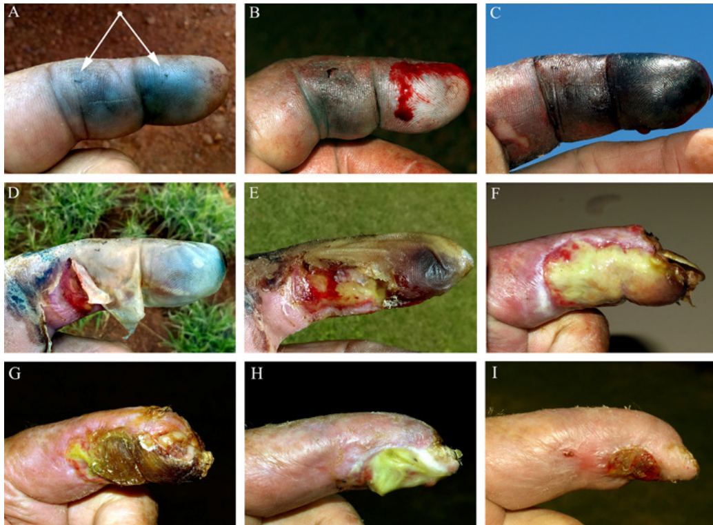
FIGURE 4. Progressive destruction and partial recovery of author's index finger, left hand after bite from Common Mulga Snake ( Pseudechis australis ) reported here. The post bite time of each photo is A – 7 hours, B – 24 hours, C – 6 days, D – 19 days, E – 21 days, F – 28 days, G – 46 days, H – 95 days and I – 113 days.